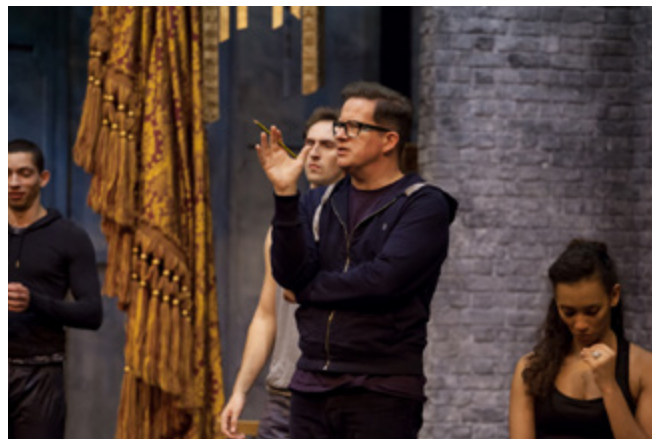
/ Matthew Bourne directing the New Adventures company during The Red Shoes creation period

Bourne himself would argue that it is difficult to describe his style because of the nature of his choreographic process. He is inspired by a plethora of stimuli, eras, dance styles and references. The movement content is deeply rooted in the background and context of the story. All movement is generated through intention-based tasks, creative exploration and play. In the context of The Red Shoes , romantic ballet and swing dance were predominantly used to help differentiate between Bourne's narrative and the various 'featured' ballets presented by Ballet Lermontov such as Les Sylphides and Lermontov's The Red Shoes Ballet . Social dances such as swing were used to develop phrases in order to portray Ballet Lermontov in a more relaxed state, for example as seen in the company's end of season party at the beginning of Act Two.