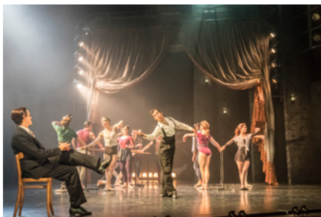
/ Ballet Lermontov in rehearsals on the Covent Garden stage

Under the direction of Boris Lermontov, Ballet Lermontov is a world-leading ballet company. In Matthew Bourne's production of The Red Shoes , the company reside in London's Covent Garden but tour extensively whilst generating a wide yet versatile repertoire. With Irina and Ivan being the principal dancers and Grischa as their ballet master, the company have defined hierarchical roles that are typical of a traditional ballet company. However, the company are a tight-knit group and everyone contributes to its success.