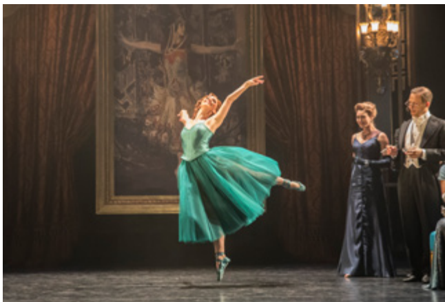
/ Lady Neston's after-show soiree

After watching The Ballet Lermontov perform the Countess Tamara's Dilemma , Lady Neston arranges a soiree with the intention of showcasing her niece, Vicky Page, to Boris Lermontov. Despite delighting the crowd with her solo, Lermontov, ignoring Vicky, offers a job to the pianist Julian Craster. Later, Vicky attends an audition with the company's ballet master, Grischa Ljubov, and is eventually picked by Lermontov to join the company as a member of the corps-de-ballet.