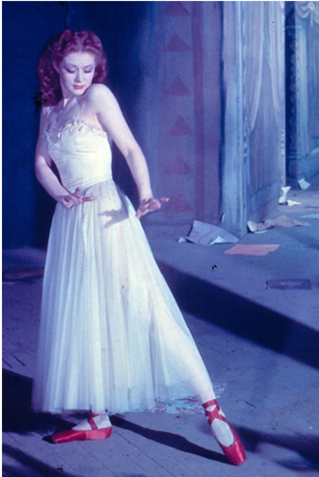
/ Moira Shearer as Vicky Page in the original 1948 film The Red Shoes

Matthew Bourne's production of The Red Shoes is heavily based on the award-winning film, however, there are some differences evident in the New Adventures production, which Bourne has made for artistic and narrative reasons.