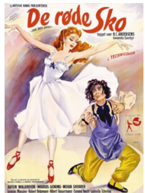
/ The Red Shoes original movie poster (Denmark)