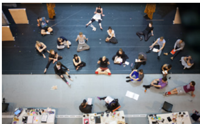
/ The Red Shoes company dancers researching their characters and reflecting during the creation period

For Bourne's production of The Red Shoes , videos were a huge source of primary research. Videos of the film's actors, famous ballet dancers of that time, videos of 1940s dance etiquette and portraits of prima ballerinas were all referred to. Once the dancers are cast the company enter a six-week rehearsal process leading up to the show's premiere performance. The dancers share and teach each other sections of choreography and, once learnt, Bourne can start to shape and refine the material and is very much like a film director during the choreographic process. He has to be responsible for not only polishing and improving individual scenes and performances but has to oversee the bigger picture and how these changes could affect the narrative.