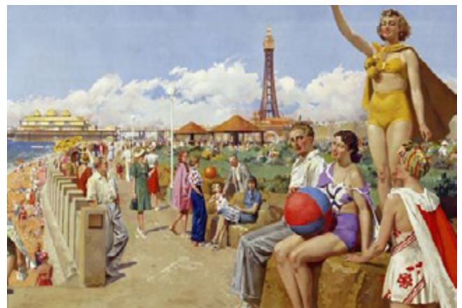
/ Beach holidays in Blackpool in 1937 by Fortunino Matania

N.B It is very useful to use images to add context to this task and build a mood board for inspiration. Find Pictures of beach life and the seaside of the 1930's