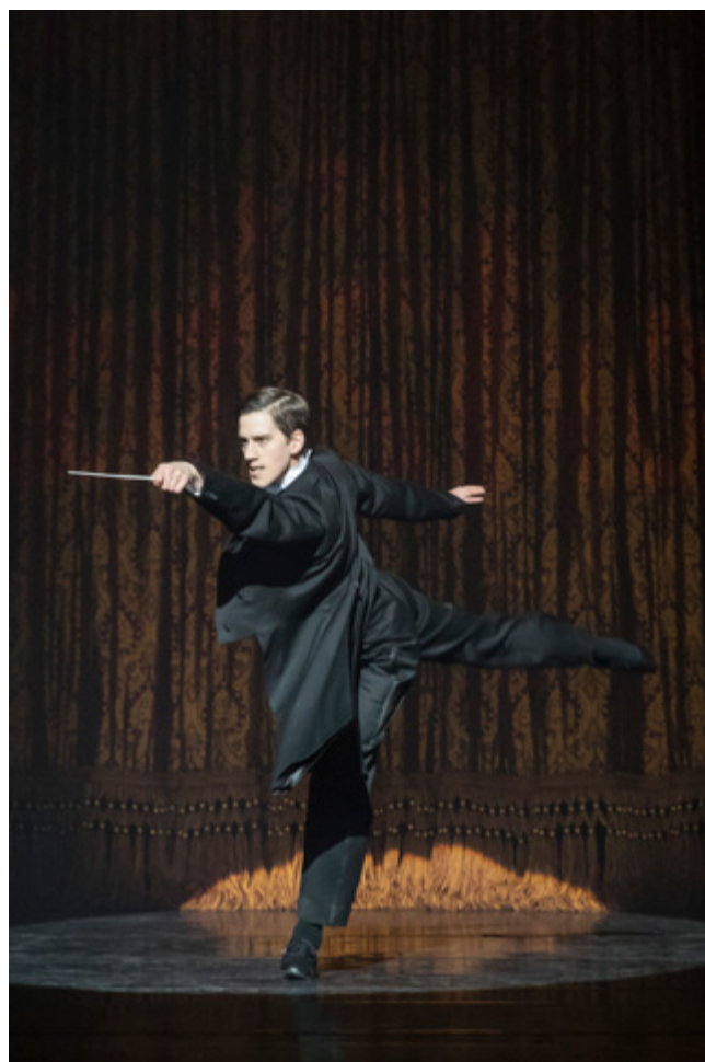
/ Dominic North as Julian Craster in The Red Shoes

Then, add in the idea of conducting an orchestra by conducting each letter to a different instrument or element of the orchestra. To increase the difficulty, you could develop the phrase by conducting the motif using different body parts.